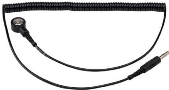
Product# 8107 Premium coil cord